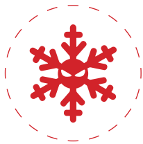
Master Evil Chill cold air

Best weapon: Ask your Asthma Master about using your blue puffer before exercise.