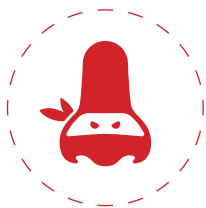
Scent Ninja your nose/hay fever

Hay fever can make your asthma worse. Make sure you are prepared to combat this villain. It can attack at any time of the year in different forms e.g. pollen, cats, strong smells.