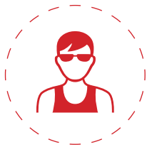
Agent Breathless exercise

Best weapon: Get your flu vaccination around April.