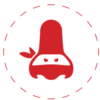
Scent Ninja your nose/hay fever

Hay fever can make your asthma worse. Make sure you are prepared to combat this villain. It can attack at any time of the year in different forms e.g. pollen, cats, strong smells.